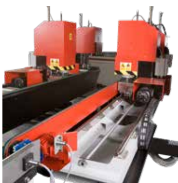
View from the outfeed