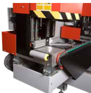
Detail welding head 1